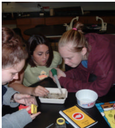
Working the Sequential Diversity Index on benthic macroinvertebrates

Environmental Science students in Nancy Sloan's class have a creek on school property to monitor. We spent one classroom period looking at Oak Orchard watershed and the creek's watershed basin, land uses and how they can affect water quality, and took stream flow measurements to determine stream volume flow. The next time we met, we sampled the benthic invertebrates to relate the composition and diversity to water quality and to the physical parameters we'd measured the week before. Our last meeting was spent collecting samples and analyzing them for dissolved oxygen, pH, temperature, turbidity, and conductivity. To close the unit they will visit the Shoremont Water Treatment Facility, which is responsible for making the Lake water clean enough to drink. "After picking bugs and trash out of our stream we need to make sure they are doing a very good job, or we may never drink from the fountain again!"