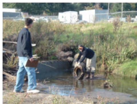
Greece Athena students at (in) Round Pond Creek

Environmental Science students in Nancy Sloan's class have a creek on school property to monitor. We spent one classroom period looking at Oak Orchard watershed and the creek's watershed basin, land uses and how they can affect water quality, and took stream flow measurements to determine stream volume flow. The next time we met, we sampled the benthic invertebrates to relate the composition and diversity to water quality and to the physical parameters we'd measured the week before. Our last meeting was spent collecting samples and analyzing them for dissolved oxygen, pH, temperature, turbidity, and conductivity. To close the unit they will visit the Shoremont Water Treatment Facility, which is responsible for making the Lake water clean enough to drink. "After picking bugs and trash out of our stream we need to make sure they are doing a very good job, or we may never drink from the fountain again!"